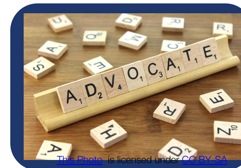
Policy & Advocacy